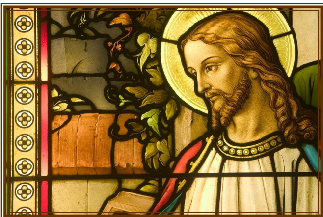
FAITH WELS LUTHERAN CHURCH 2011 CALENDAR

The youth group has created a 2011 calendar to be sold to raise money to support one of our synodical schools, Martin Luther College.